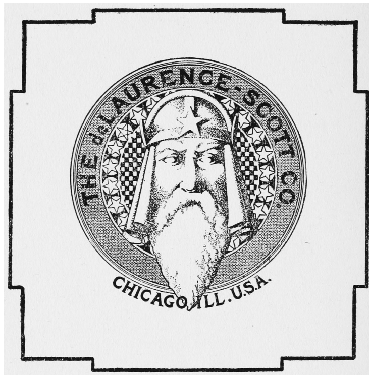
de LAURENCE SCOTT, Chicago Ill.

Obvious typographical errors have been silently corrected. Variations in hyphenation have been standardised but all other spelling and punctuation remains unchanged.