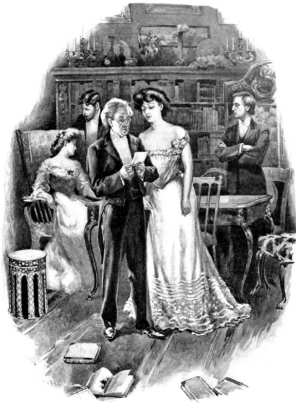
"THE GIRL'S EYES WERE OPENING AS FROM NATURAL SLUMBER" ToList

She smiled faintly as she recognized him. "My arms are numb, and my feet feel as if strips of wood were nailed to my soles," she answered, wearily, "and my head is aching dreadfully; but that will soon pass."