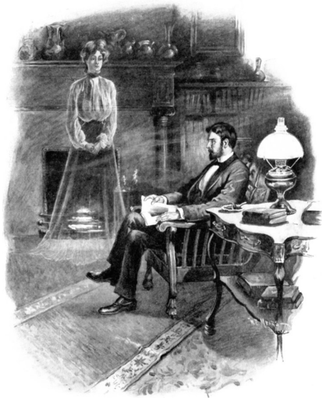
"VIOLA, TOO, CAME BACK TO BEWITCH HIM FROM HIS READING" ToList

They came of good stock, these Servisses, and knew it and felt it. Breeding was indicated in their well-set heads, in their shapely hands, and especially in their handsome noses. "We are inclined to be stubby, that's true, but we have the noses of aristocrats—they go back to the Aryans of the Danube," said Mrs. Rice to a friend. "Morton cannot consider a girl of questionable pedigree, no matter how rich or charming she may be. We believe in stock—not in family, but strain ; a family is an accident, a strain is a formation. The Mortons and the Servisses are strains . Their union in my brother will yet make itself felt." Her confidence in his powers was absolute. "He is one of the greatest young men of his day. Time will show," she added, as if to clinch her argument.