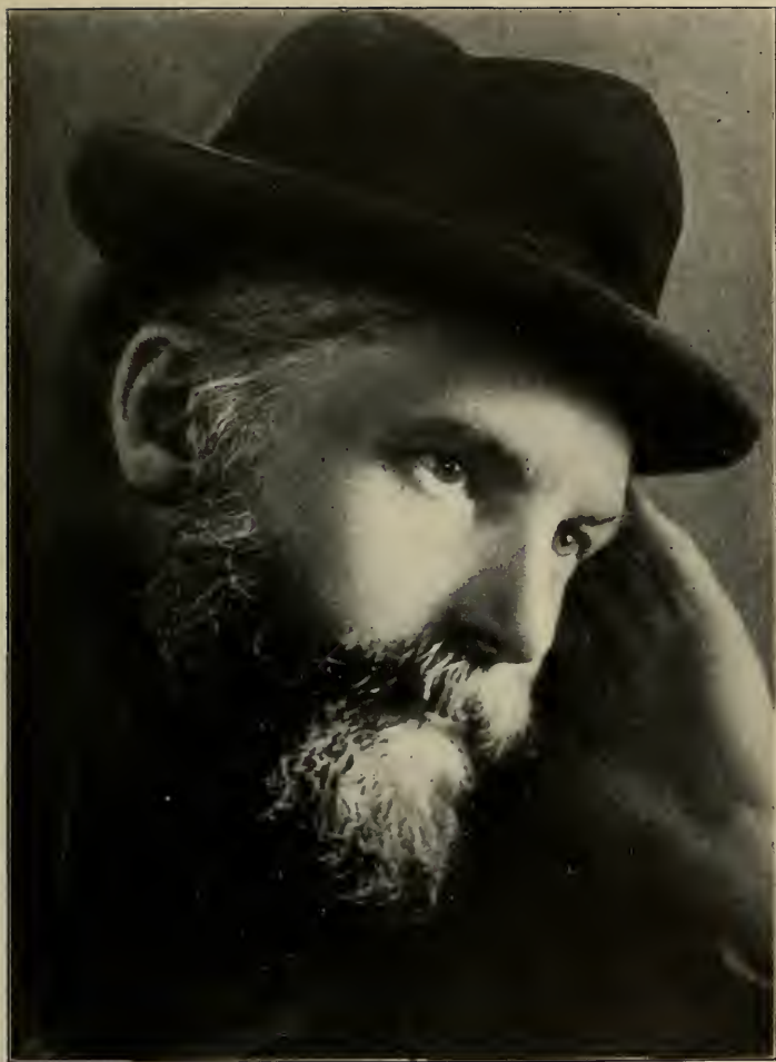
MR. FREDERIC W. H. MYERS