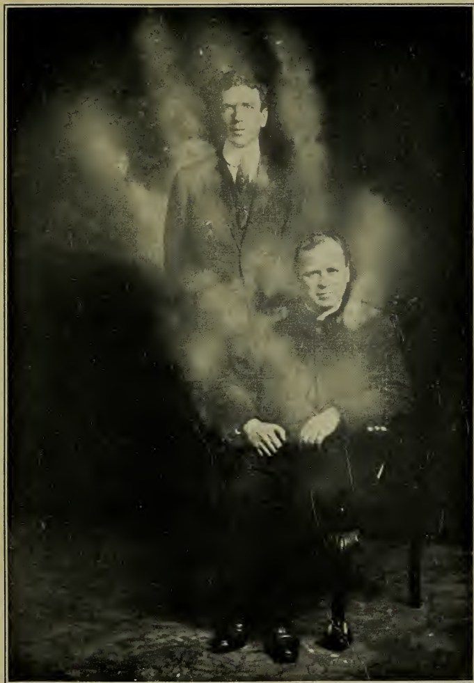
THE GHOSTLY HAND WHICH APPEARED ON THE NEW YORK PHOTOGRAPHER'S CAREFULLY GUARDED PLATE. (SEE APPENDIX IV)