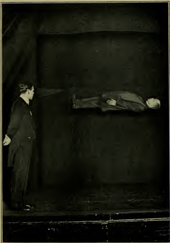
"SPIRIT LEVITATION," PHOTOGRAPHED UNDER "TEST CONDITIONS" IN SPRINGFIELD, MASS. (SEE APPENDIX V)