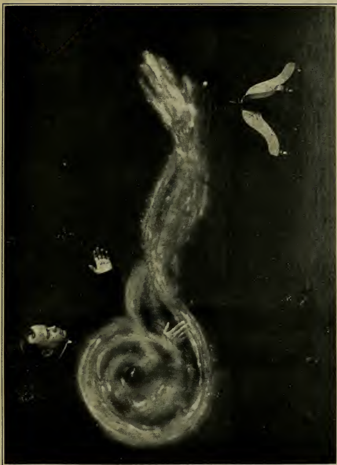
"AN ASTRAL ARM AND HAND" AN AUTHENTIC PHOTOGRAPH OF A FAKED PHENOMENON, TAKEN IN WORCESTER, MASS. (SEE APPENDIX IV)