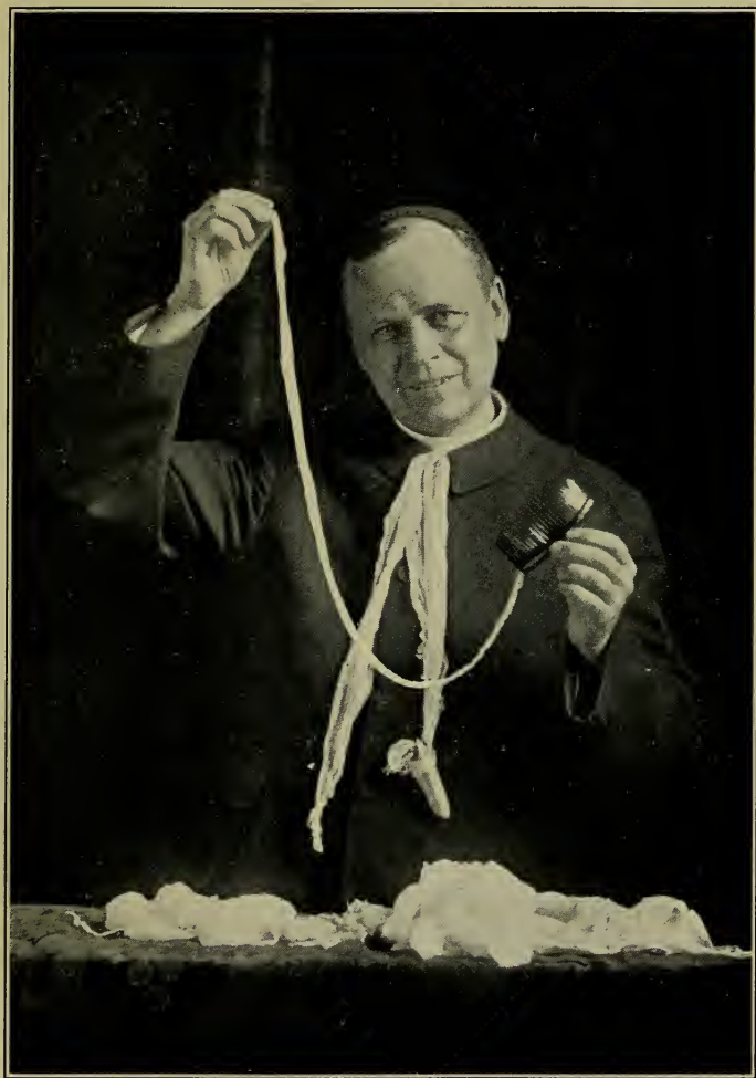
YARDS OF "ECTOPLASM" JUST "MATERIALIZED" FROM A FALSE FINGER AND THE CROSS BAR OF A COMB. (SEE APPENDIX III)