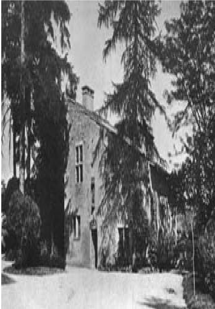
THE HOME OF JOAN AT DOMREMY.