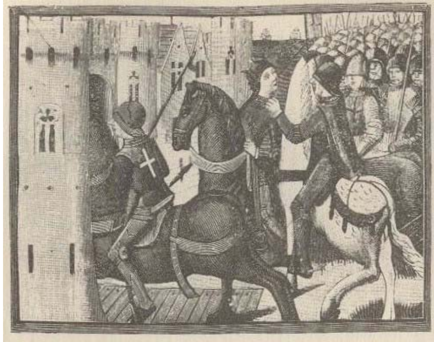
JOAN TAKEN PRISONER From a XV th Century MS