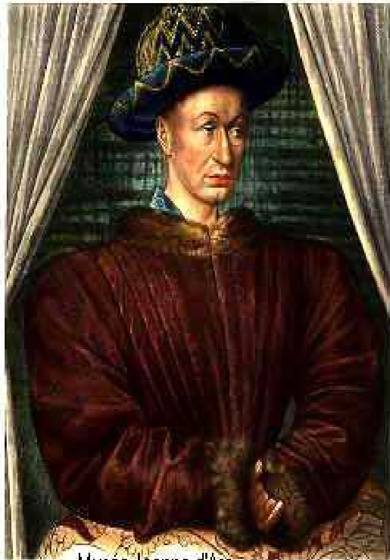
Musée Jeanne d'Arc