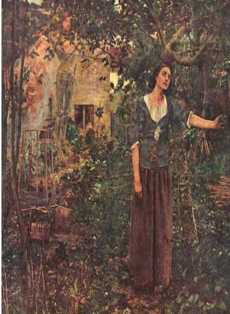
THE VISION OF JOAN OF ARC