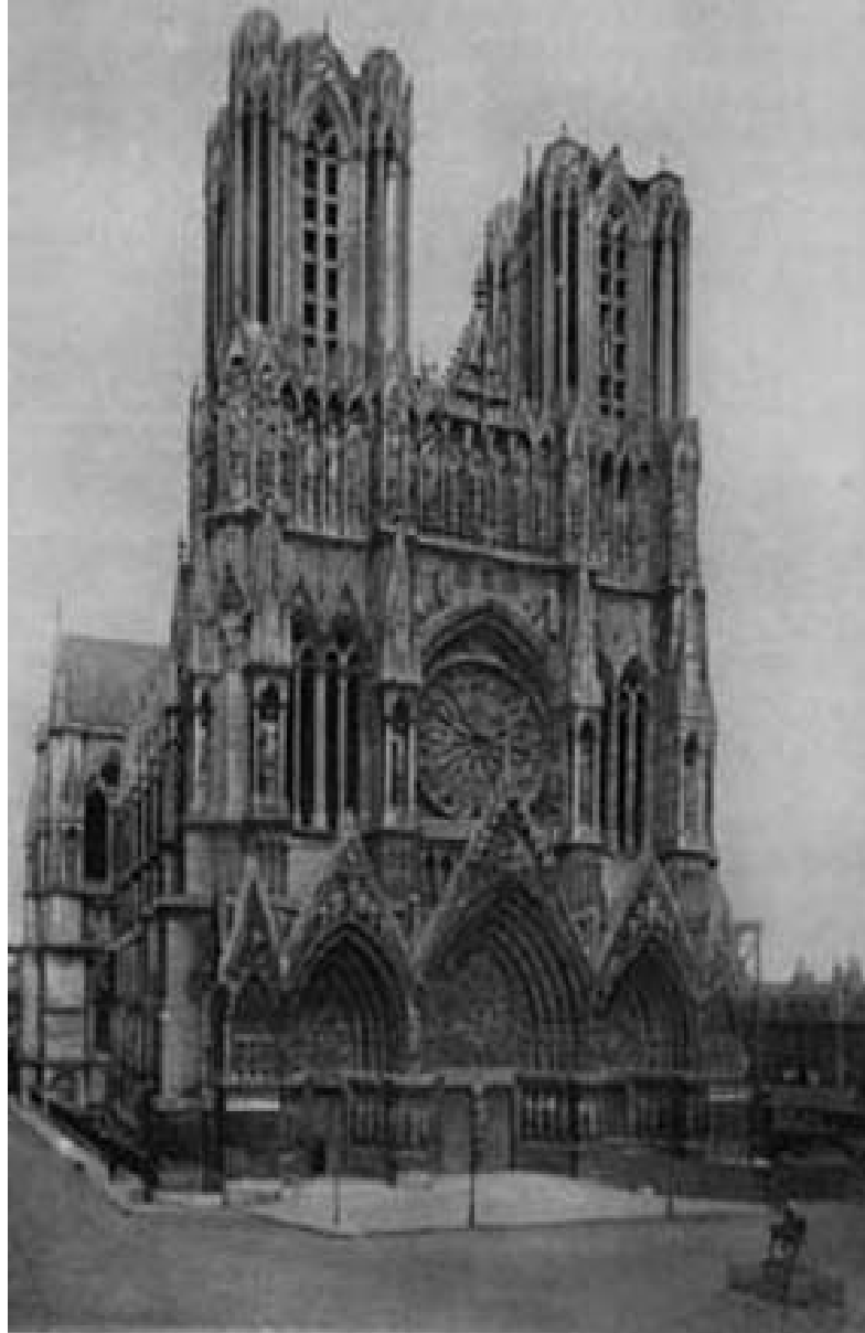
THE CATHEDRAL AT REIMS